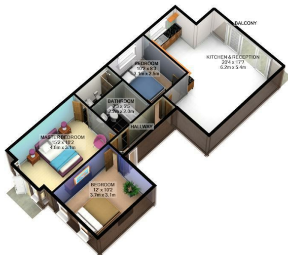
2ND FLOOR THE OLD WAREHOUSE APARTMENTS N22 TOTAL APPROX. FLOOR AREA 750 SQ.FT. (69.6 SQ.M.)

For illustrative purposes only. Decorative finishes, fixtures, fittings and furnishings do not represent the current state of the property. Measurements are approximate. Not to scale Made with Metropix ©2015